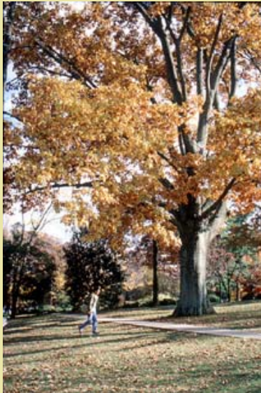
Central campus mall with a large red oak ( Quercus rubra )