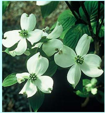
Appalachian spring White Flowering Dogwood