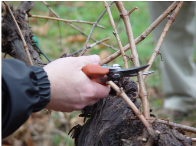
Pruning a grape vine above, pruning a fruit tree at right