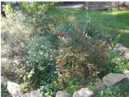
Asters, Frosted Mountain Mint and Virginia Sweetspire in the rain garden.