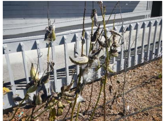
Many insects depend on our common Milkweed as a primary food source