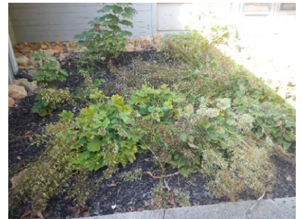
Heuchera and Oakleaf Hydrangea flourish in the bed behind the Rec Building and fill this once-empty space