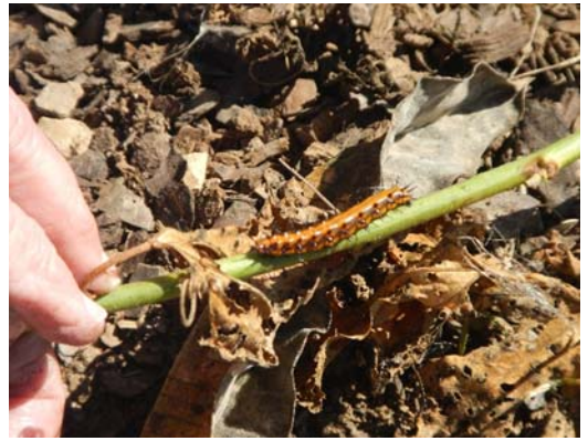
Gulf Fritillary caterpillar on its host plant, Passionvine

The Northeast Tennessee Master Gardener Association continues their partnership with Warriors' Path State Park. This past year has been a year of maintaining and growing our existing gardens. We are concentrating on adding more bee and butterfly attracting plants and many of the native plants we use are recommended by the North American Butterfly Association.