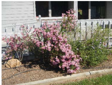
New England and Aromatic Asters in the Ottenfeld Bed