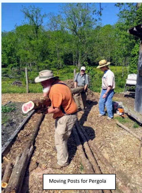
Moving Posts for Pergola