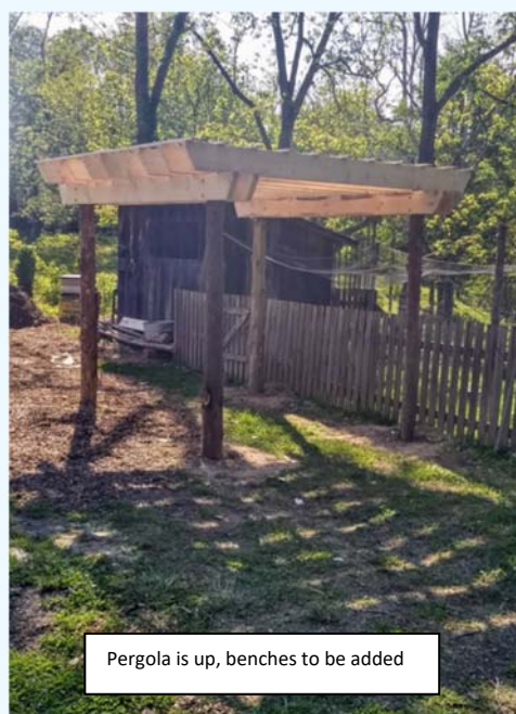
Pergola is up, benches to be added