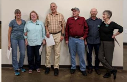
200-300 Hours - 2018