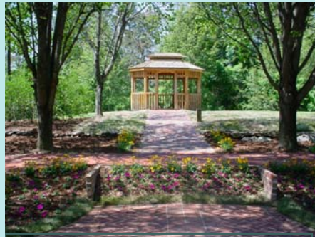
Winged Deer Park Gazebo