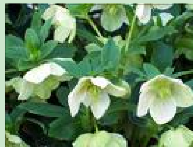
Lenten Rose