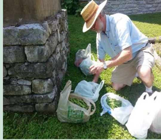
Bags of Beans headed to Kitchen of Hope