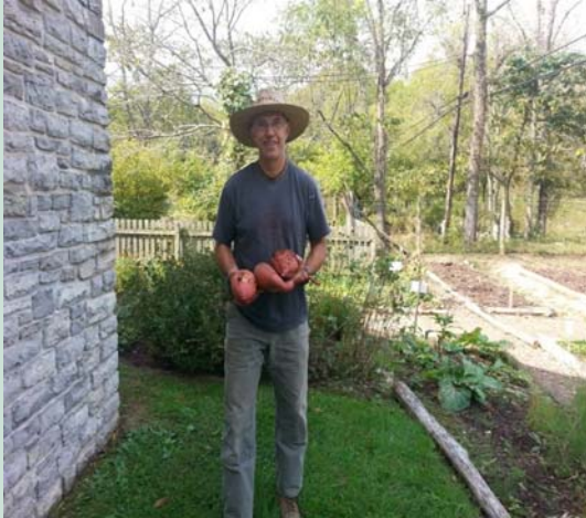
A few of the Sweet potatoes to be donated to Kitchen of Hope