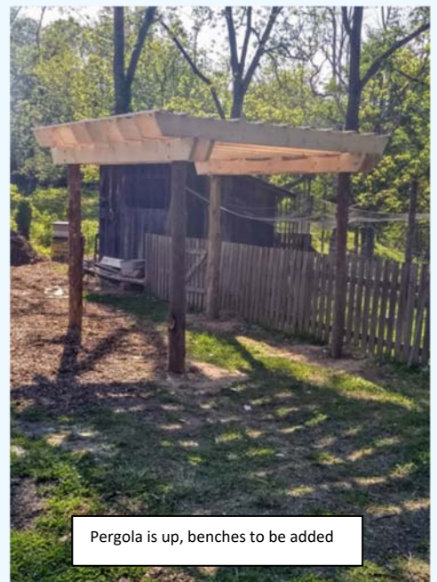
Pergola is up, benches to be added