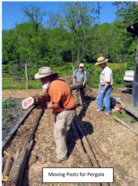
Moving Posts for Pergola